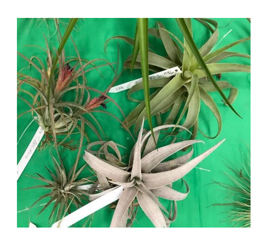
Above: Plant table by Bird Rock Tropicals. Below: Tillandsia 'Curly Slim' one of the items for auction

Our own Scott Sandel entertained us with a beautiful presentation about his adventures in Peru. In this travelogue, he took us to isolated spots in Northern Peru with incredible photos of landscapes, archeological sites and yes, bromeliads. Best of all, most of the broms in the slideshow are only found in nature, so what a treat! Plus, Scott included a 360-degree vista and special effects that drew ooohs and aahs from the crowd!